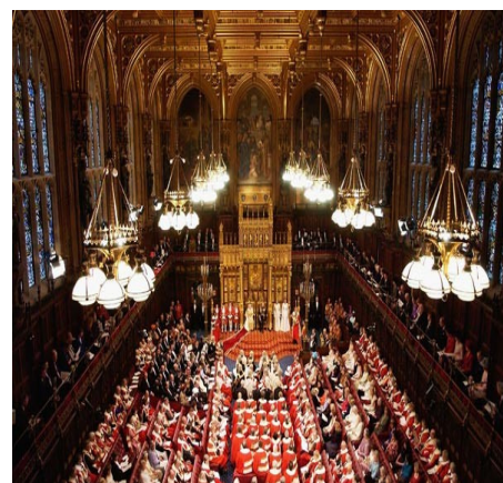
The Pharmaceutical Society of Northern Ireland has briefed local Members of the House of Lords on how the Health and Social Care Bill affects Northern Ireland

We are pleased they share our passion for pharmacy regulation, policy-making and implementation to be kept local."