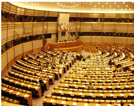
All three Northern Ireland Members of the European Parliament support the maintenance of local pharmacy regulation and representation.